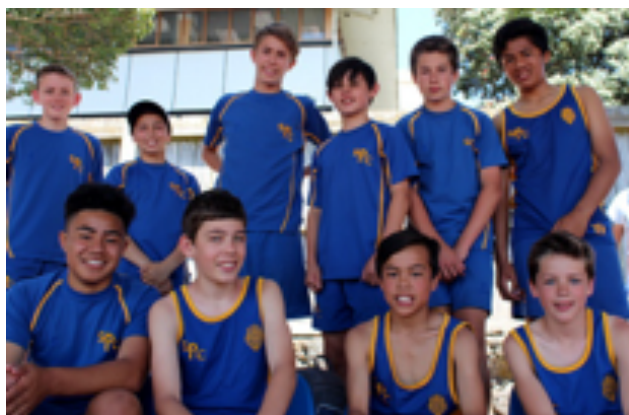
Above: Central Zone Athletics Team