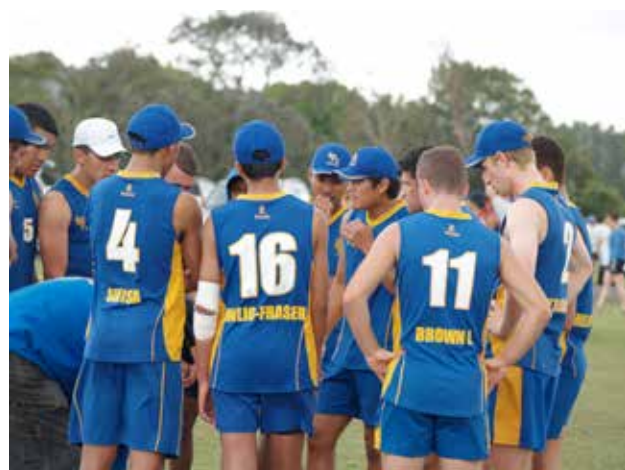
Above: Touch Rugby Nationals team in Papakura