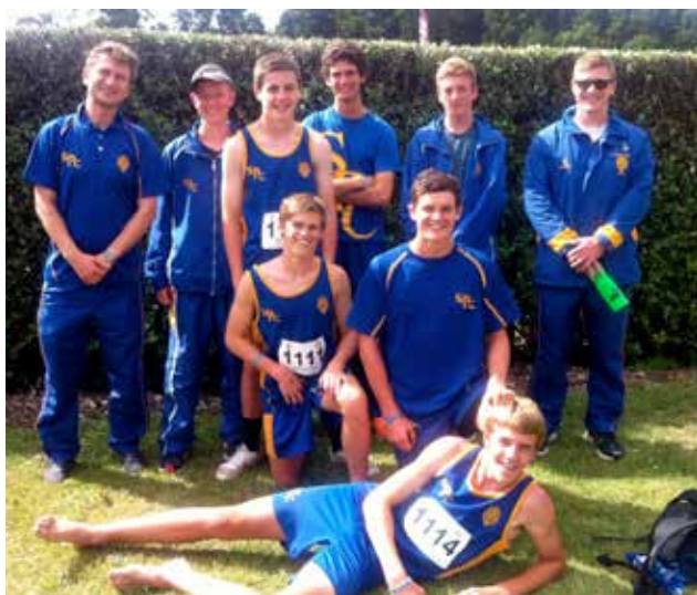
Above: SPC National Athletics Championship team and teachers in Hamilton

Senior – U19 as at the 1st January 2014.