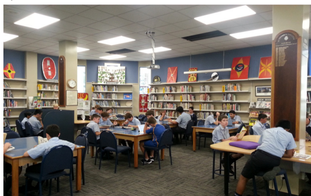
Library at lunchtime – A great place to be!

We have many new books in the library and are very happy to source boys' (and staff!) requests for specific titles.