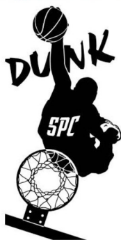
Wall decal - DUNK Alpha Designs

Decal applying size : 120cm(L) x 60cm(W)