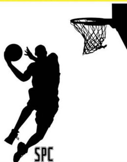
Wall Decal - Basketball Dunk - SPC Alpha Designs

The player : 120cm(L) x 60cm(W); The basketball hoop : 45cm(L) x 60cm(W)