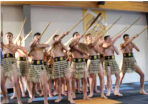
Btm right: Samoan Group