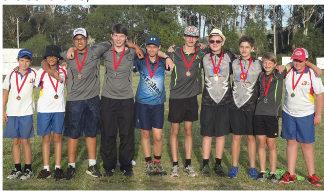
Day 1: Matchplay

15 boys went down to Rotorua to compete in the North Island J.A.M.A Championships – the most from any single school in New Zealand. The Tournament was split into two parts, the Saturday being matchplay, or a '1v1' scenario between several age groups. The Sunday was a longer, accumulative score-type victory. Both days were equally as long and taxing on the boys. The mornings were freezing, with the temperature soaring in the afternoon. The winds weren't gusty, but changed direction often, leading to difficult shooting conditions. Despite this, Saint Peter's archers shot exceedingly well. The medal winners are as follows;