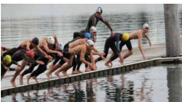
Above: Tag Team participants