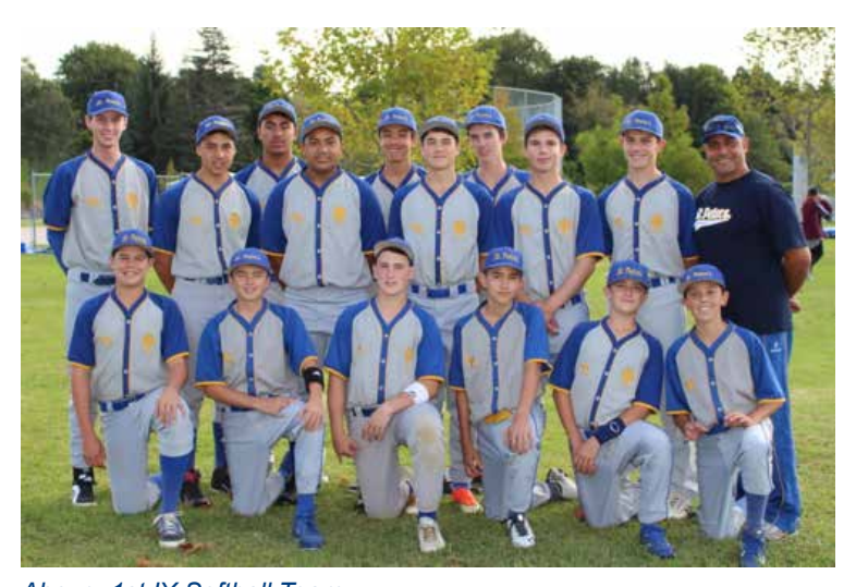
Above: 1st IX Softball Team