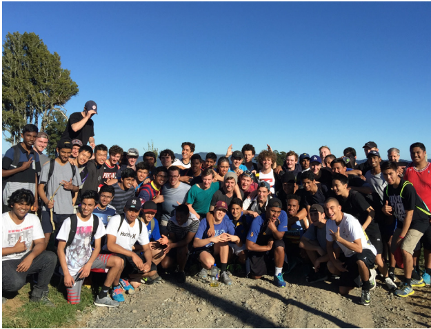
Above: Members of the Catholic Character group rest after tramping through farm land that used to be a Cherry orchard in the days of Suzanne Aubert.