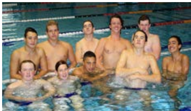
Senior A Team

Water Polo continues this term with three intermediate teams starting their competitions and Juniors begin training in Term 3.