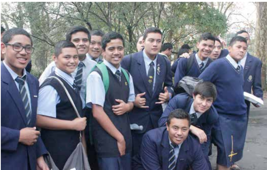
SPC participants in the Annual Samoan Cultural Event at AGGS