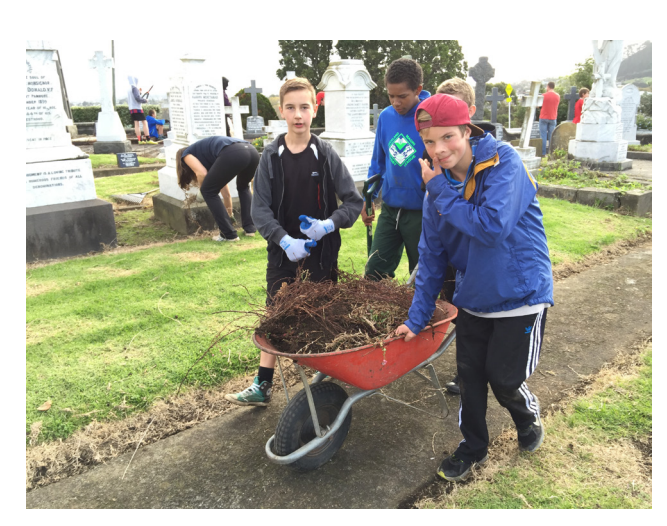
Pictured: Nolan students working at St Patrick's Cemetery in Panmure on May 17th.

• Auckland Domain – gardening and rubbish clearing