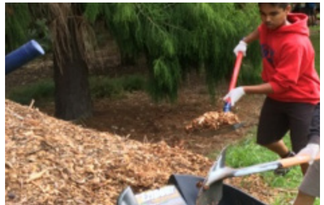
Above: Zico & Evander working together to fill the barrows

After communications between the staff and students, it was decided the dates 3rd, 10th and 17th of May were suitable, with each being a 2 hour session adding to 6 hours of service in total. The guideline being to aim to get 20-30 people there each week to complete the given tasks - mainly mulching and tidying the grounds and gardens of the Domain.