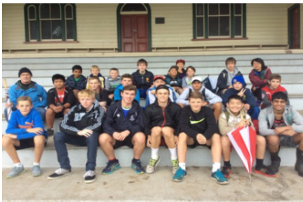
Above: All the boys and teachers looking ready to go on the last session.