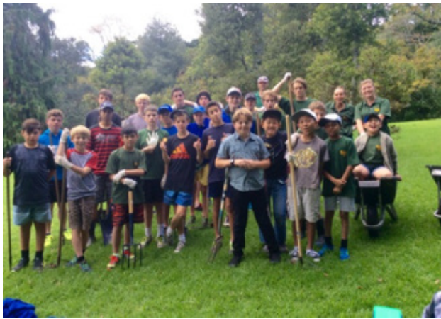
Above: Staff and students in week 2 of service