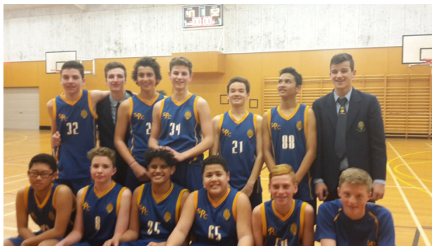
The U15 gold team after winning their Central Zone grade 52 – 47 over Sacred Heart.

The middle school team competed in the Central Zone basketball tournament on Wednesday placing 2nd overall. Good preparation for them as they lead into the NZ AIMS tournament in September.