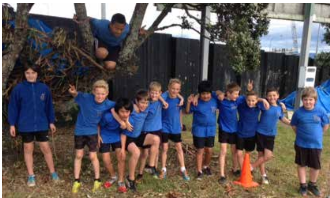
Above: Saint Francis Year 6 Boys