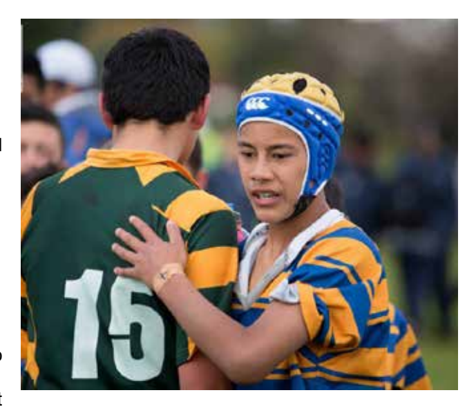
Above: AIMS Rugby Sevens team competing in Tauranga