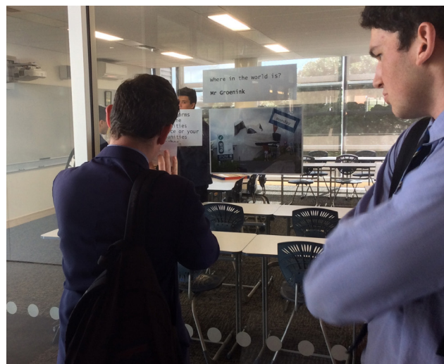
Above: senior students taking part in the photo competition