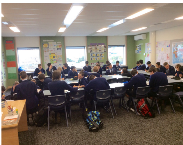
Above: Tuesday's History Quiz