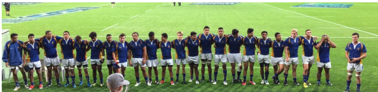
SPC Team of the Year – 1st XV Rugby