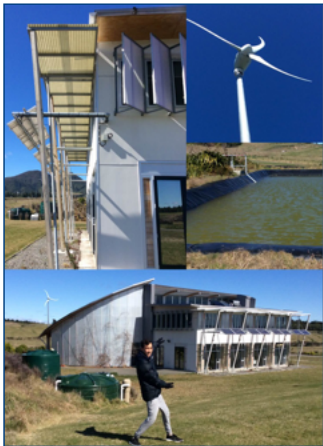
Paul Nuku's winning photographs

Students were asked to present captivating and creative photographs that illustrate how sustainable building practices are incorporated into the world we see around us. Below is Paul's competition entry and his commentary on the sustainable practices photographed.