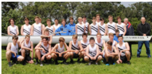
SPC Rowing Squad