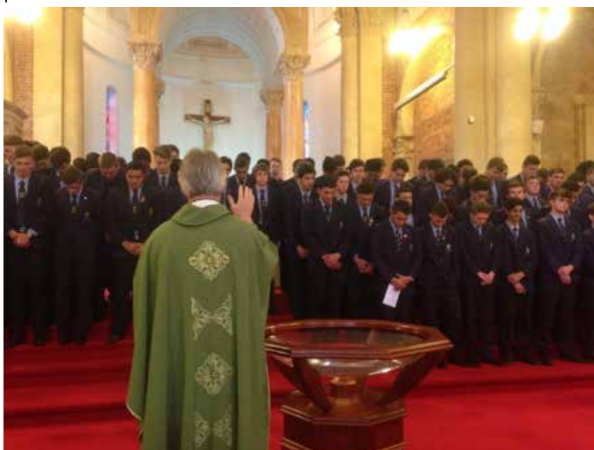
Right: Students receive a blessing at Leavers Mass, Thursday November 6th, St Michael's Church, Remuera

Year 12 Peer Ministers (current Year 11) + Year 13 Cadre (current Year 12): Thursday December 4th, meet at the Gym at 9am, 3pm finish.