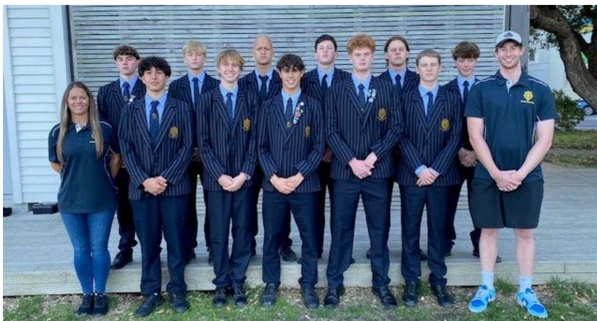
Premier Waterpolo Team