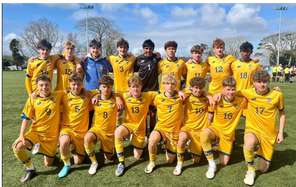
1 st XI Football