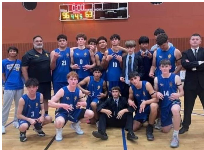
1 st V Basketball