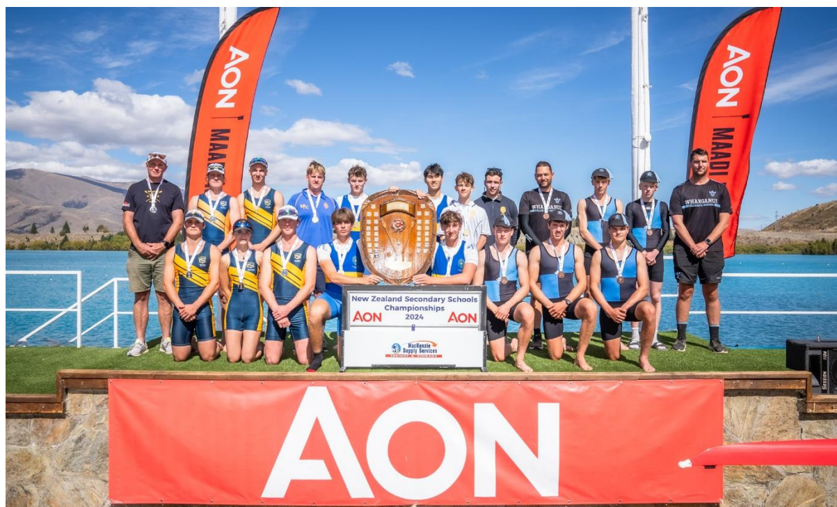
U18 Quad – National Champions